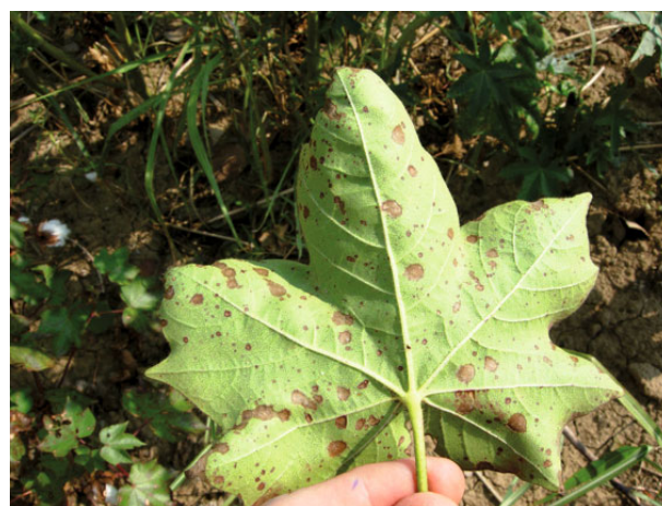
Figure 5. Lesions caused by bacterial blight ( Xanthomonas campestris pv malvacearum ) in cotton ( Gossypium hirsutum ).

Ca confers resistance against Pythium , Sclerotinia , Botrytis and Fusarium (Graham, 1983). Ca can be mobilized in lesions of alfalfa caused by Colletotrichum trifolii and supports the growth of the pathogen by stimulating the macerating action of pectolytic enzyme polygalacturonic acid transeliminase (Kiralý, 1976). A putative mechanism by which Ca is believed