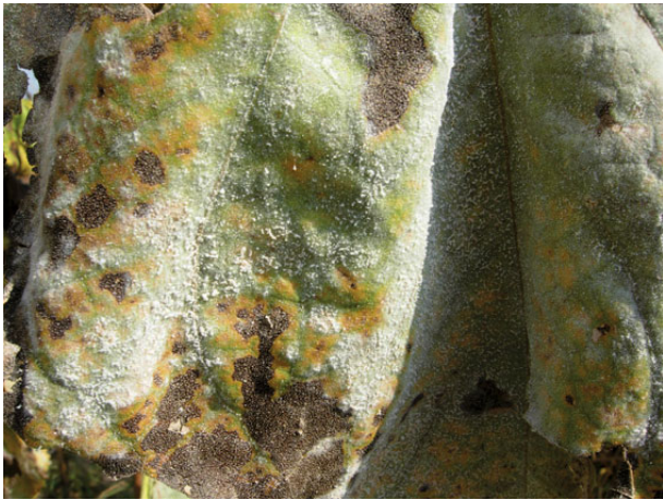
Figure 1. Powdery mildew ( Erysiphe cichoracearum ) with an extensive growth of white, powdery fungal mycelium on the upper leaf surface of sunflower ( Helianthus annuus ).

Gibberella zeae . The form of N can affect the pH of the soil and also the availability of other nutrients such as Mn. Also, the level of N can affect the phenolics content of plants, which are precursors of lignin. In addition, at high levels of N there is a decrease in Si content, which can affect the disease tolerance. In this case, the subject is quite complex and more research is needed to find a specific mechanism that explains these observations because the interaction between disease and host depends on several factors, including host response, previous crop, N rate, residual N, time of N application, soil microflora, ratio of \text{NH}_4^+ -N to \text{NO}_3^- -N and disease complex presence.