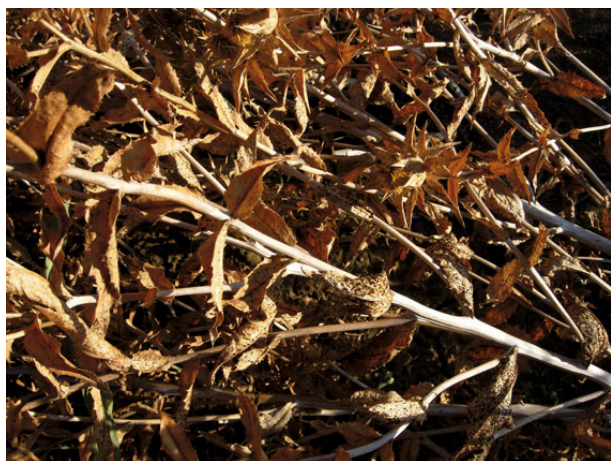
Figure 2. Damage caused by safflower rust ( Puccinia carthami ).