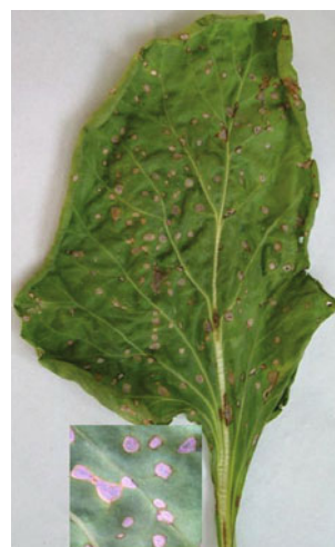
Figure 4. Light gray lesions with a dark border in sugar beet ( Beta vulgaris ) leaves caused by Cercospora beticola .

dissolve the cell walls of the conducting vessels, which leads to wilting symptoms. In addition, plant tissues low in Ca are also much more susceptible than tissues with normal Ca levels to parasitic diseases during storage. Ca treatment of fruits before storage is therefore an effective procedure for preventing losses both from physiological disorders and from fruit rotting. Adequate soil Ca is needed to protect peanut pods from infections by Rhizoctonia and Pythium and application of Ca to the soil eliminates the occurrence of the disease (Huber, 1980).